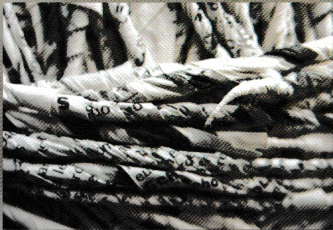
5. Karen Trask, Petit Larousse illustré 1983 (detail), 2006