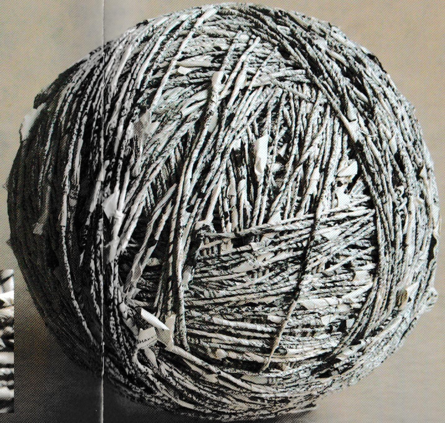
6. Karen Trask, Petit Larousse illustré 1983 , 2006